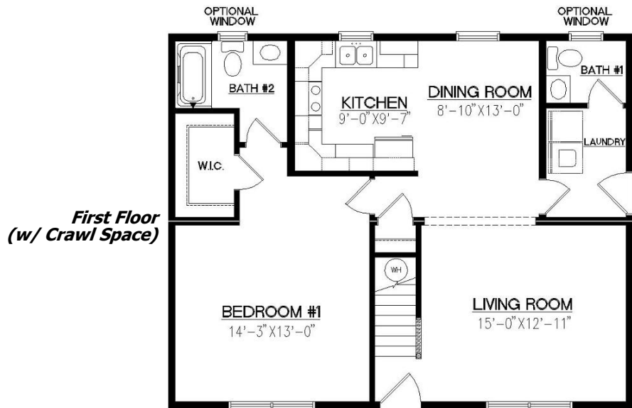
First Floor (w/ Crawl Space)

Note: Proposed second floor available upon request.