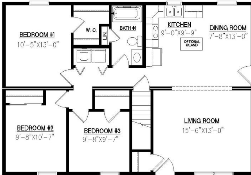
First Floor (w/ Basement)

Note: Renderings are for illustrative purposes only and may vary per series standard specifications.