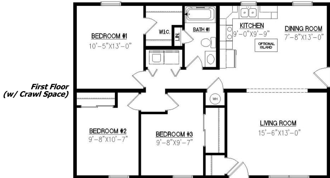
First Floor (w/ Crawl Space)

Ranch 27'-6" x 40'-0" 1100 SQFT 3 Bedrooms / 1 Bath