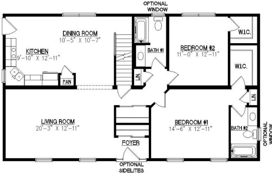
First Floor (w/ Basement)

Note: Renderings are for illustrative purposes only and may vary per series standard specifications.