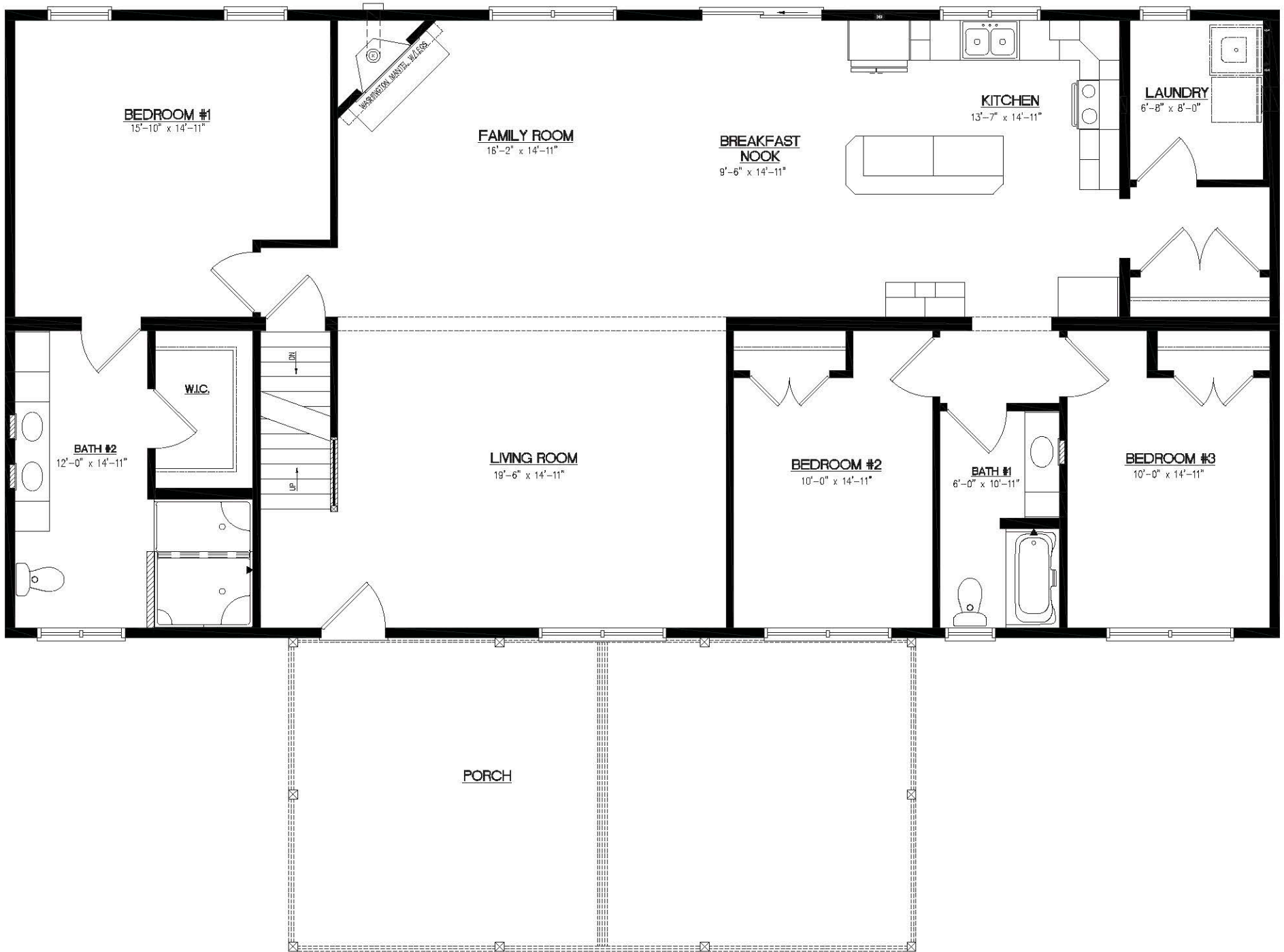
1ST FLOOR LAYOUT 47'-3" x 64'-0"